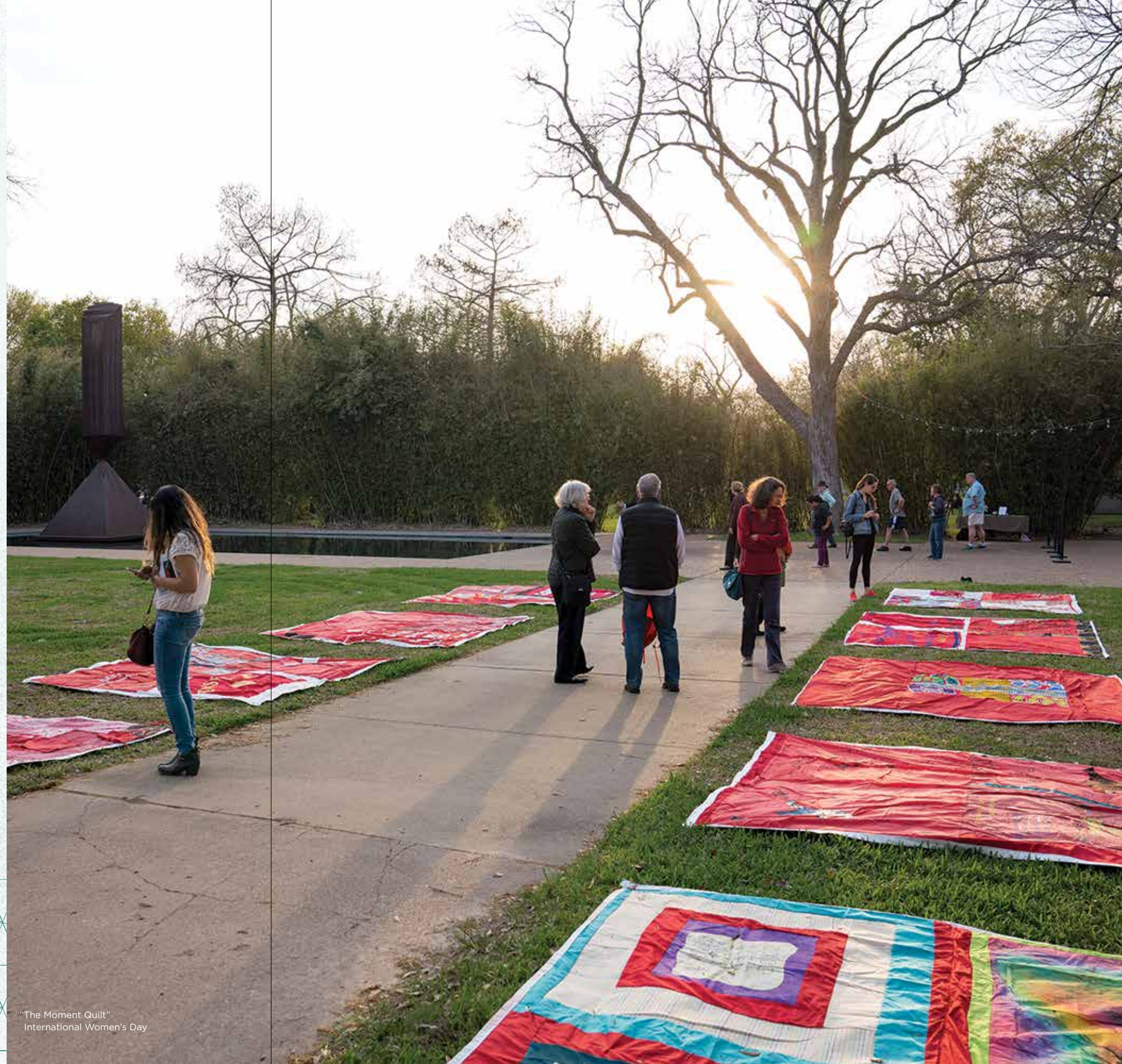
“The Moment Quilt” International Women’s Day